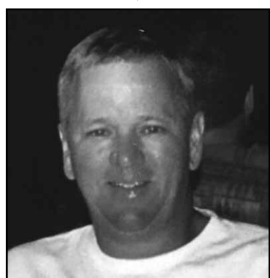
If you see this "CUSTOM HOME BUILDER" wish him a Happy "50th" on Tuesday, Oct. 7th

HEALTH: SHEVA SUPPORT GROUP: If you have been victimized by sexual abuse and need support—join us! Call (563) 219-2157 for details